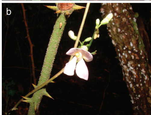
FIG. 3. Phaseolus texensis in mixed woodlands at Travis Co. a. Plant climbing habit b. flower at anthesis (Photos W. R. Carr).

(2.0–3.0 mm), pendent, elastically dehiscent, compressed; valves chartaceous, strigose, expanding slightly over the 5-6(7) seeds. SEEDS oblong, ca. 5.0 mm long, ca. 4.5 mm wide; hilum oblong, ca. 1.0 mm long, with epihilum; lens not prominent; halo black; surfaces smooth, brown mottled with black. SEEDLINGS with hypogeal germination (or phanerogeal); epicotyl pilose, often redpigmented; stipules entire to bifid; petioles with basal and apical pulvini; stipels minute; eophylls simple, ovate, obtuse to acute at tip,