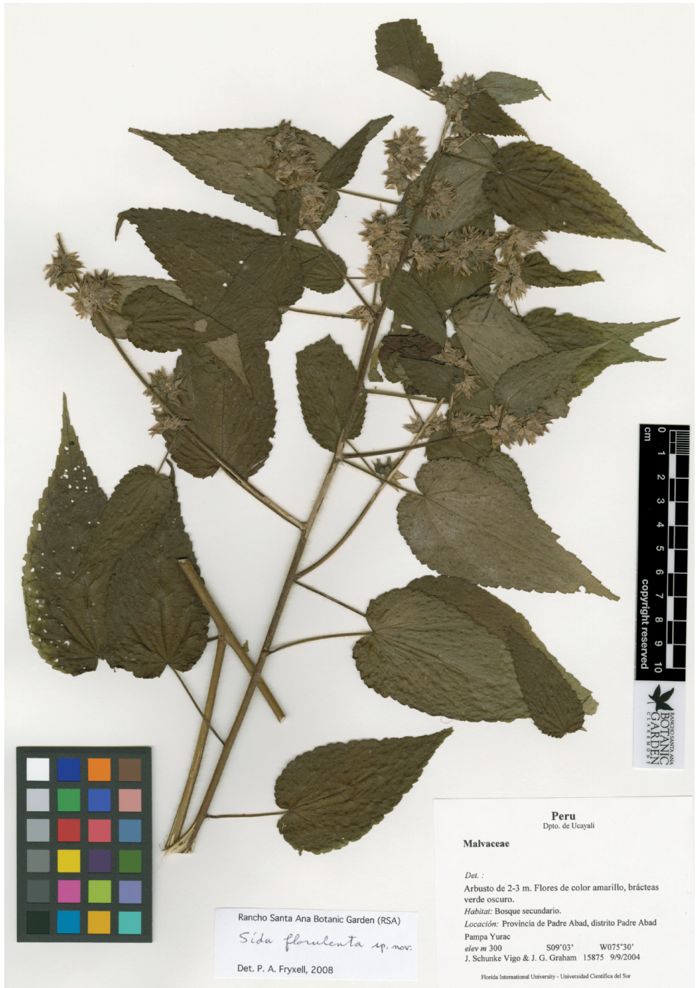
FIG. 2. Sida florulenta sp. nov. Isotype (RSA).