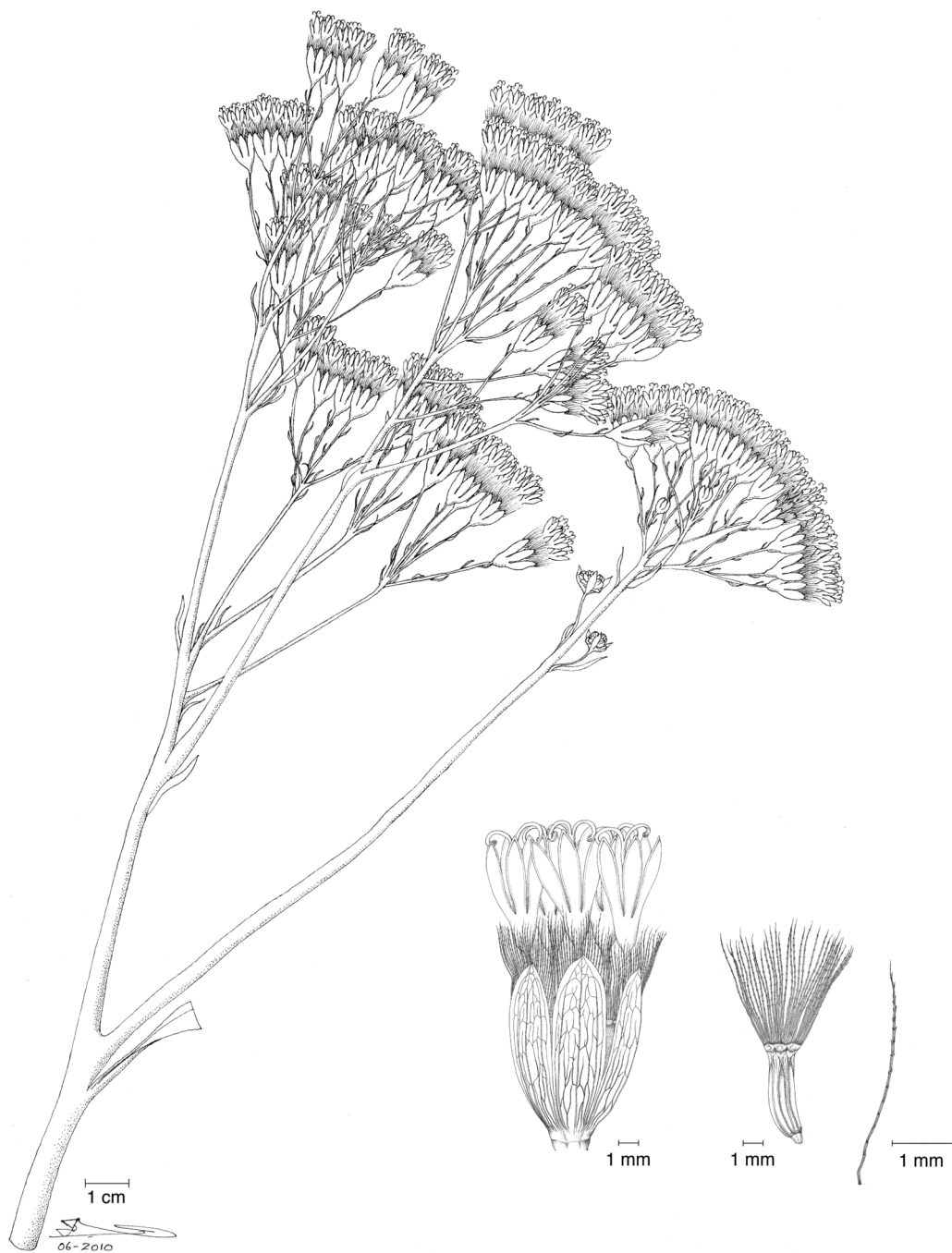
FIG. 2. Habit, capitula, achene, and pappus bristle of Psacalium putlanum (drawn from holotype).