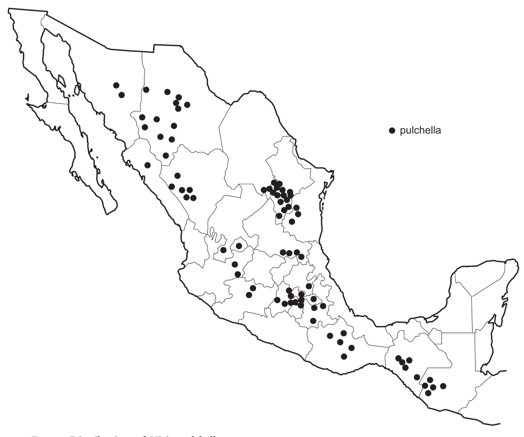
FIG. 5. Distribution of Vicia pulchella.

Tech. Bull. 1601: 25. 1979, non Vicia mexicana Hemsl. Type: Mexico. Nuevo Leon, Puerta, Jul 1933, C.H. Muller and M.T. Muller 510 (Holotype: MEXU; Isotypes: F, TEX).