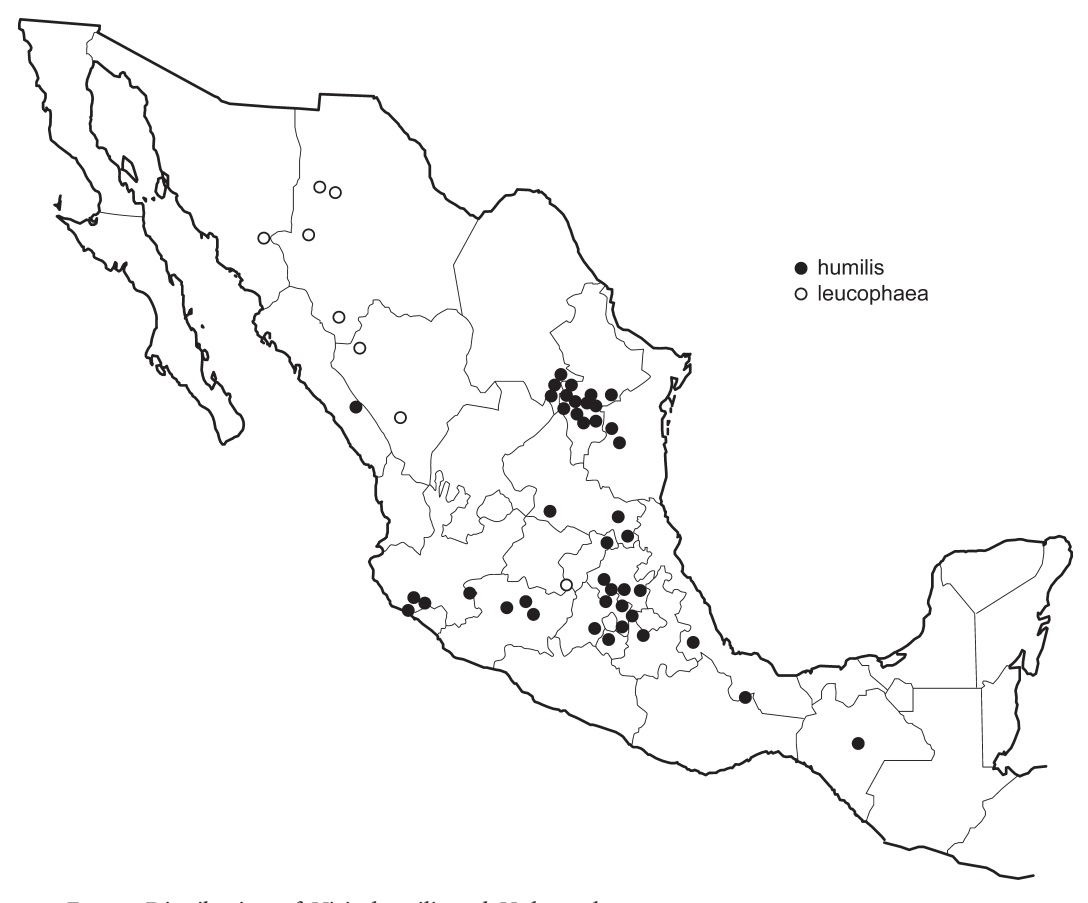
FIG. 3. Distribution of Vicia humilis and V. leucophaea.

shown in Fig. 3. Note my comments under Vicia hassei re keying errors.