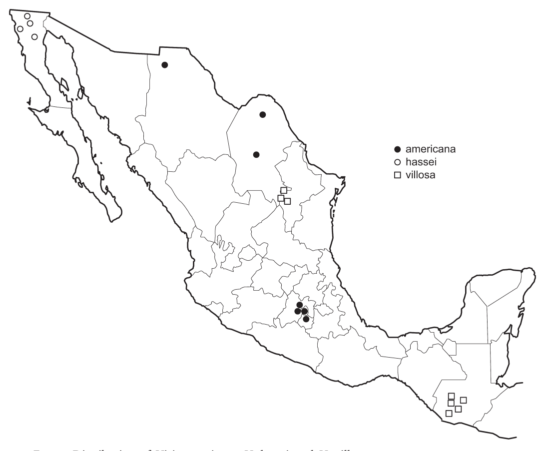
FIG. 1. Distribution of Vicia americana, V. hassei, and V. villosa.

known by other populations from that general area (Fig. 1).