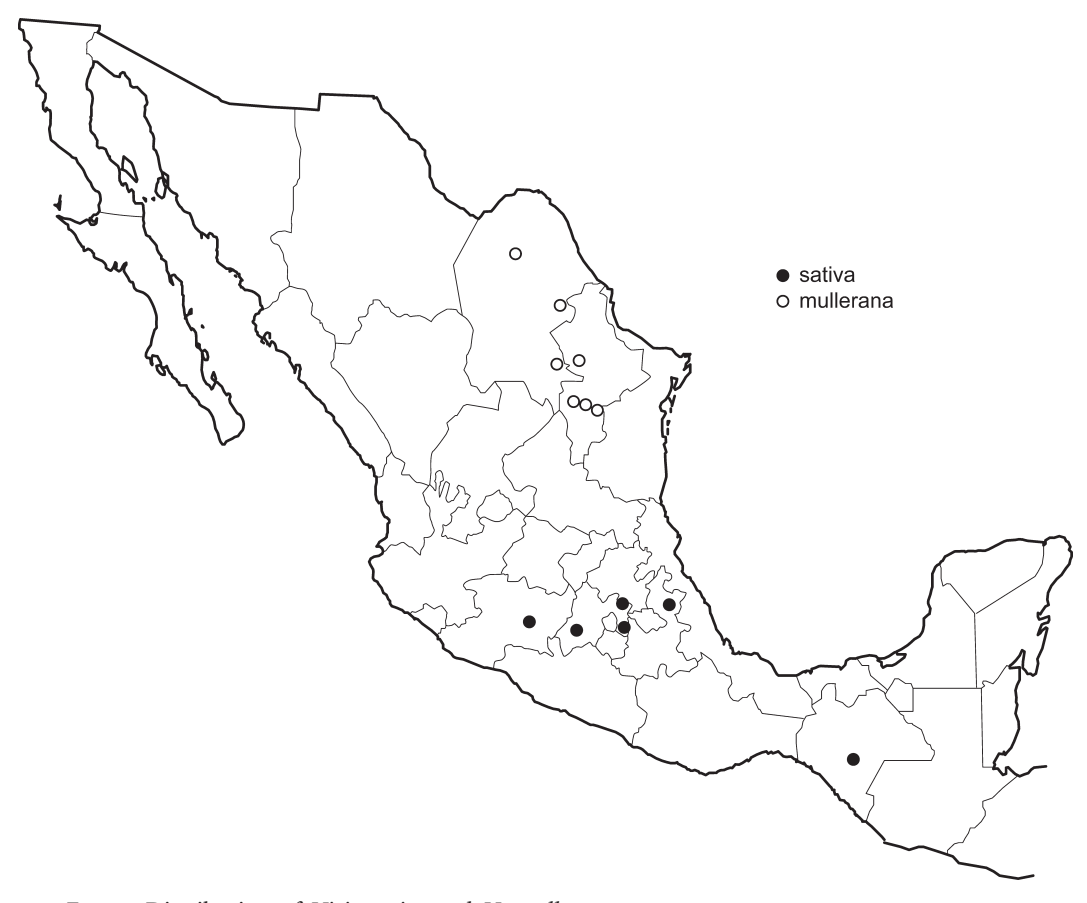
FIG. 4. Distribution of Vicia sativa and V. mullerana.

but not in Mexico, is shown in Fig. 2 (taken from Turner et al. 2003).